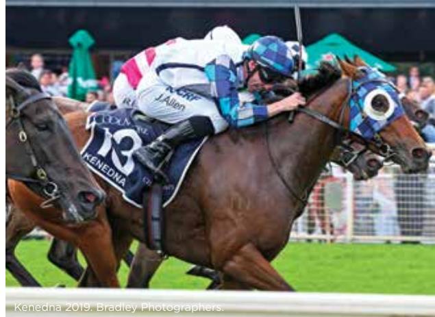
Kenedna 2019.