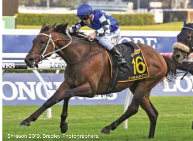
Shraaoh 2019.