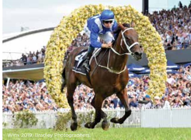
Winx 2019.

The Agency George Ryder Stakes is not only one of Australia's best races but consistently rates amongst the highest in the world.