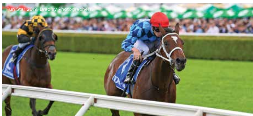
Fun Star 2019.

In what could be a New Zealand invasion, their very best could best be 'the Shark'. He didn't win a race in the Spring but won many admirers through his TAB Epsom and Cox Plate efforts. He has ticked off that G1 marker with a devastating finish in the Waikato Sprint, making up 6L in the home straight. He plots the Winx path to the Longines Queen Elizabeth Stakes.