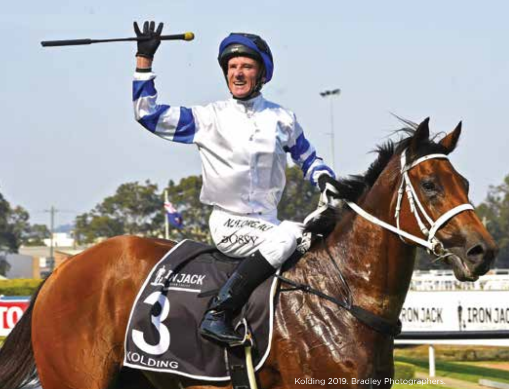
Kolding 2019.