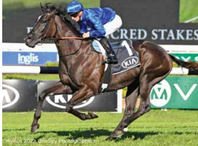
Avilius 2019.

As one of five Group 1s on Longines Golden Slipper Day, the Ranvet Stakes often provides its own piece of racing theatre.