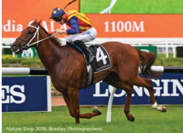
Nature Strip 2019.

Last year Nature Strip fulfilled his enormous potential, winning his first of several Group 1s.