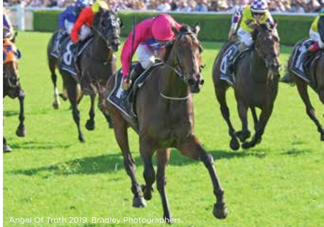
Angel Of Truth 2019.