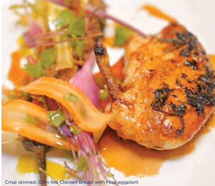
Crisp skinned, Corn fed Chicken Breast with Miso eggplant