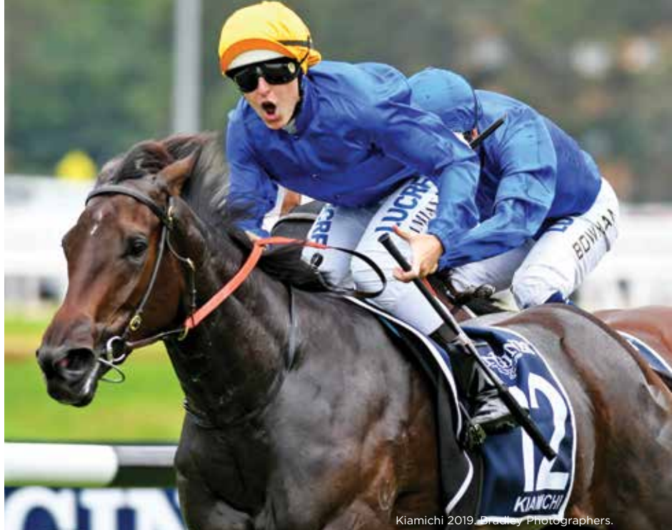
Kiamichi 2019, Bradley Photographers.