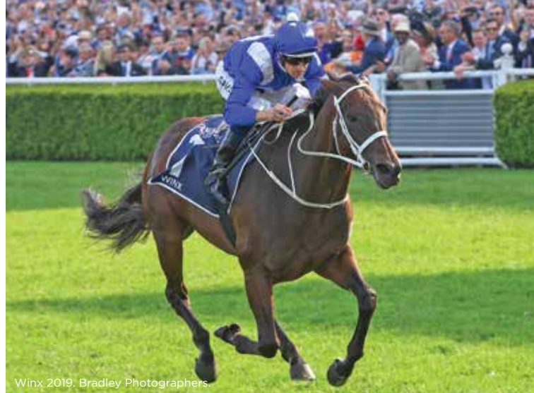
Winx 2019.