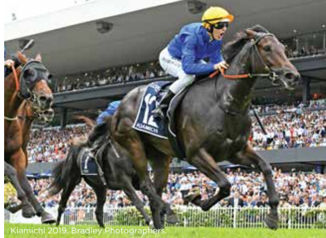
Kiamichi 2019.

$3,500,000 GROUP 1 (1200M) SET WEIGHTS 2YO