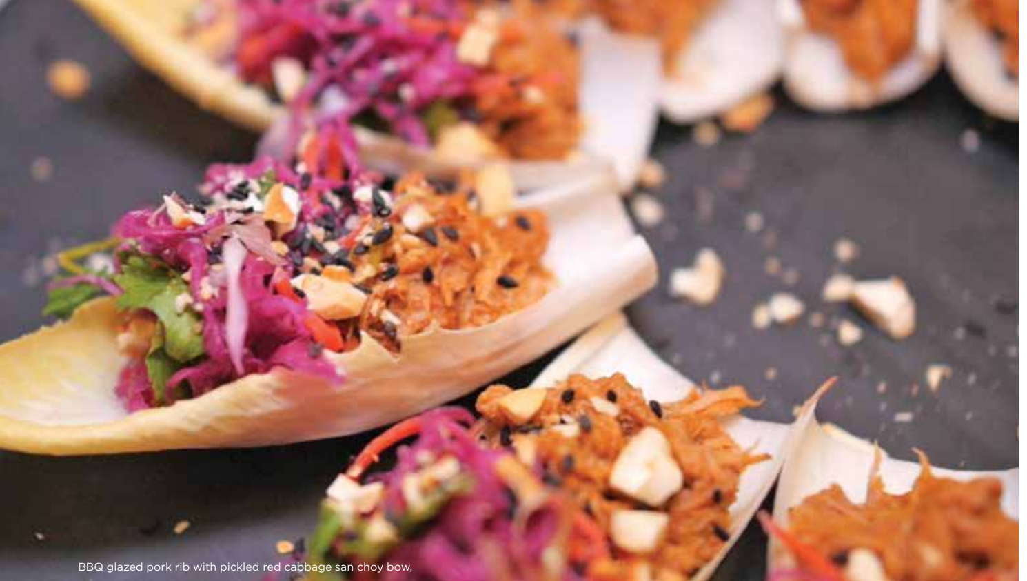
BBQ glazed pork rib with pickled red cabbage san choy bow,