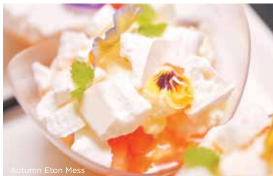
Autumn Eton Mess