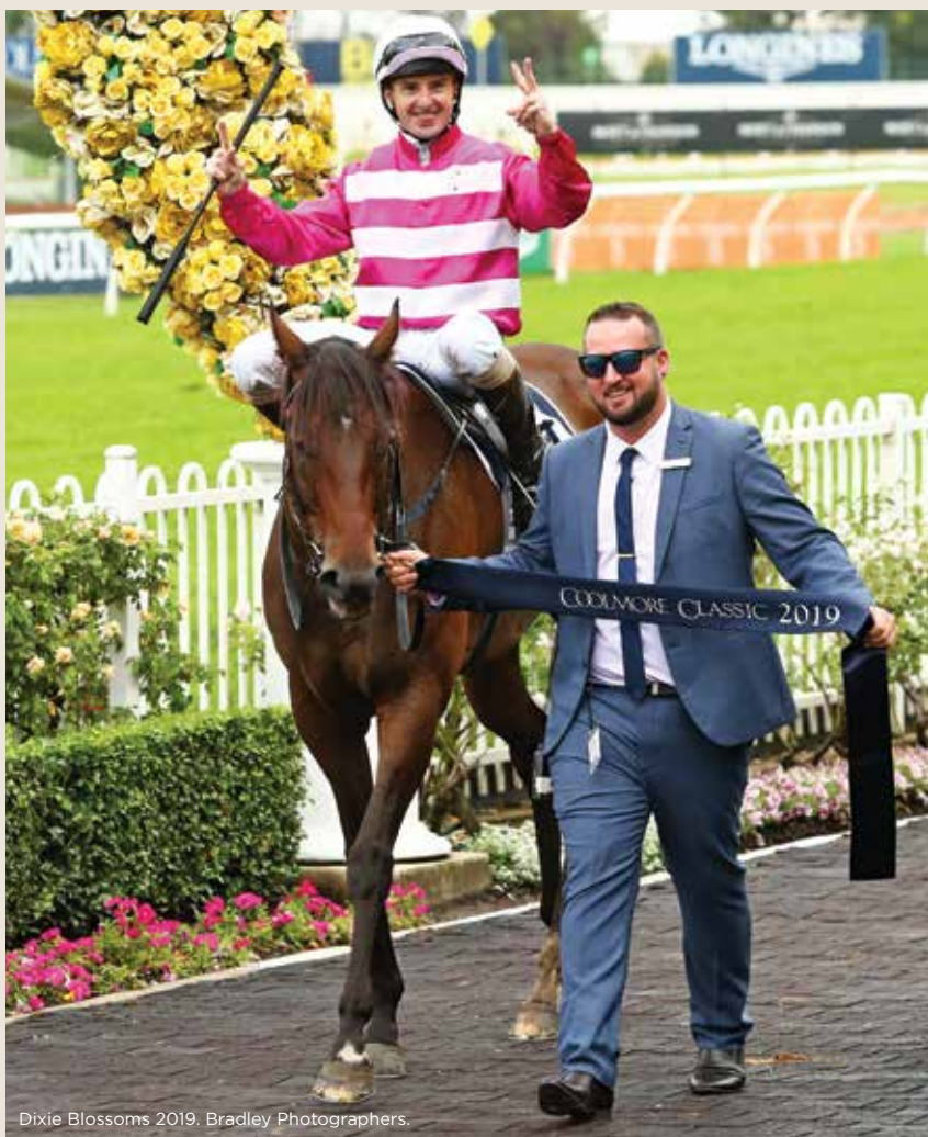
Dixie Blossoms 2019.