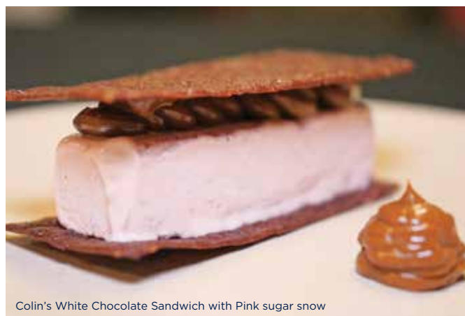
Colin's White Chocolate Sandwich with Pink sugar snow