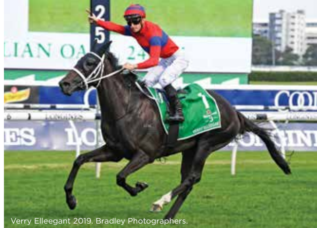
Verry Elleegant 2019.

It is also another race the kiwi gallopers have thrived in. Last year Verry Elleegant confirmed her staying talent for star Kiwi-born jockey James McDonald.