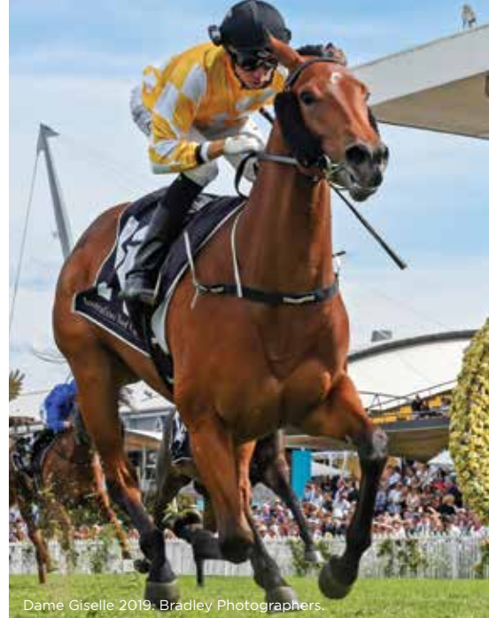
Dame Giselle 2019.

You had to be looking forward when seeing what this import did at the end of his first racing season in Australia. Now that he has had time to acclimatise and enjoy that spell, expect him to be measuring up in the staying contests. He will need ground in time as we saw first up when outsprinted but staying on.