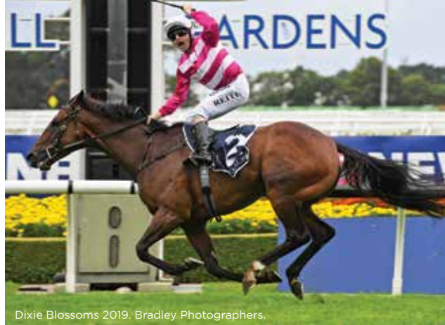
Dixie Blossoms 2019.

Fillies and mares did not have Group 1 races specifically for them until the Coolmore Classic was awarded the ultimate status in 1984.