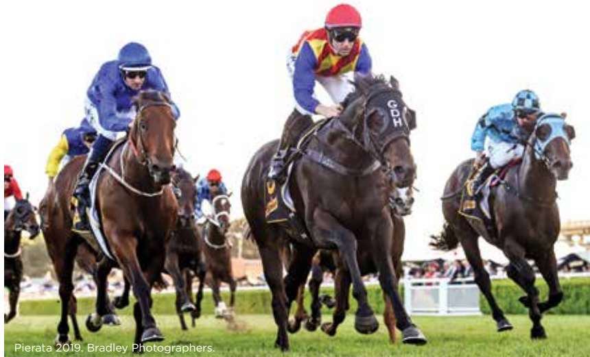
Pierata 2019, Bradley Photographers.