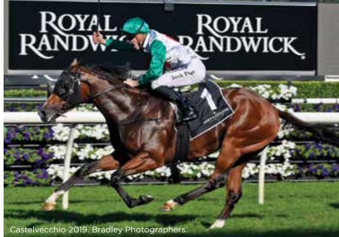
Castelvechio 2019.

The last two editions were a perfect example of a horse needing the mile – with Seabrook in 2018 and Castelvechio in 2019 coming into their own up the testing Royal Randwick straight.