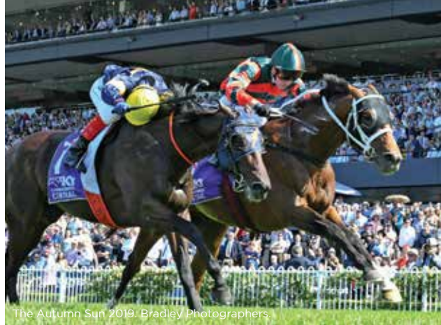
The Autumn Sun 2019.

$600,000 GROUP 1 (2000M) SET WEIGHTS 3YO