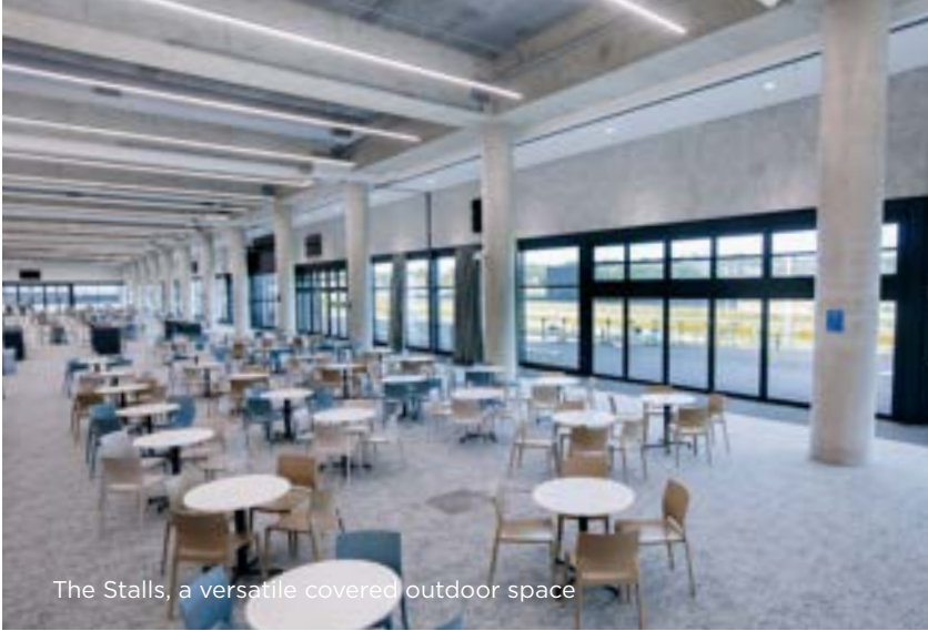
The Stalls, a versatile covered outdoor space