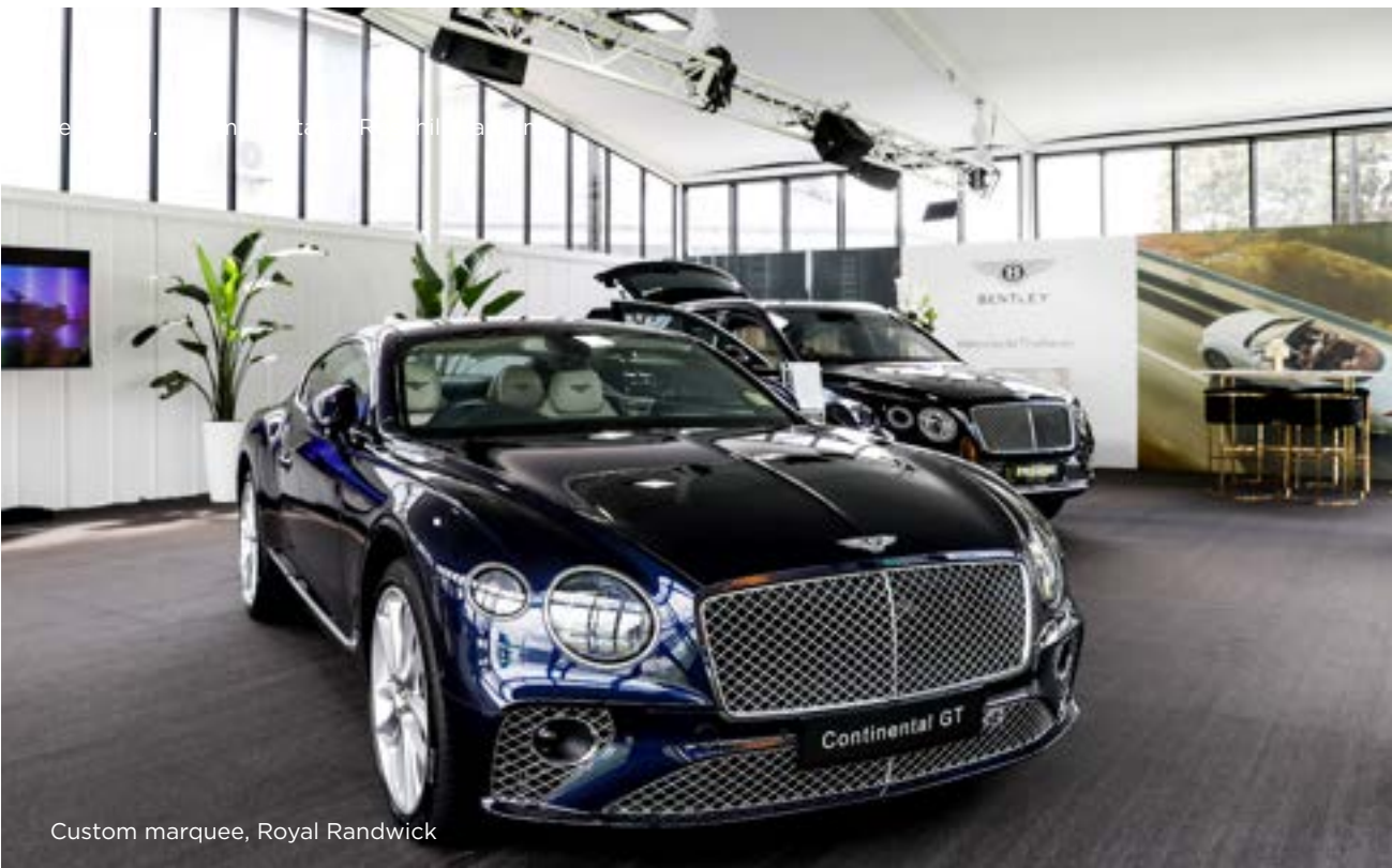
Custom marquee, Royal Randwick