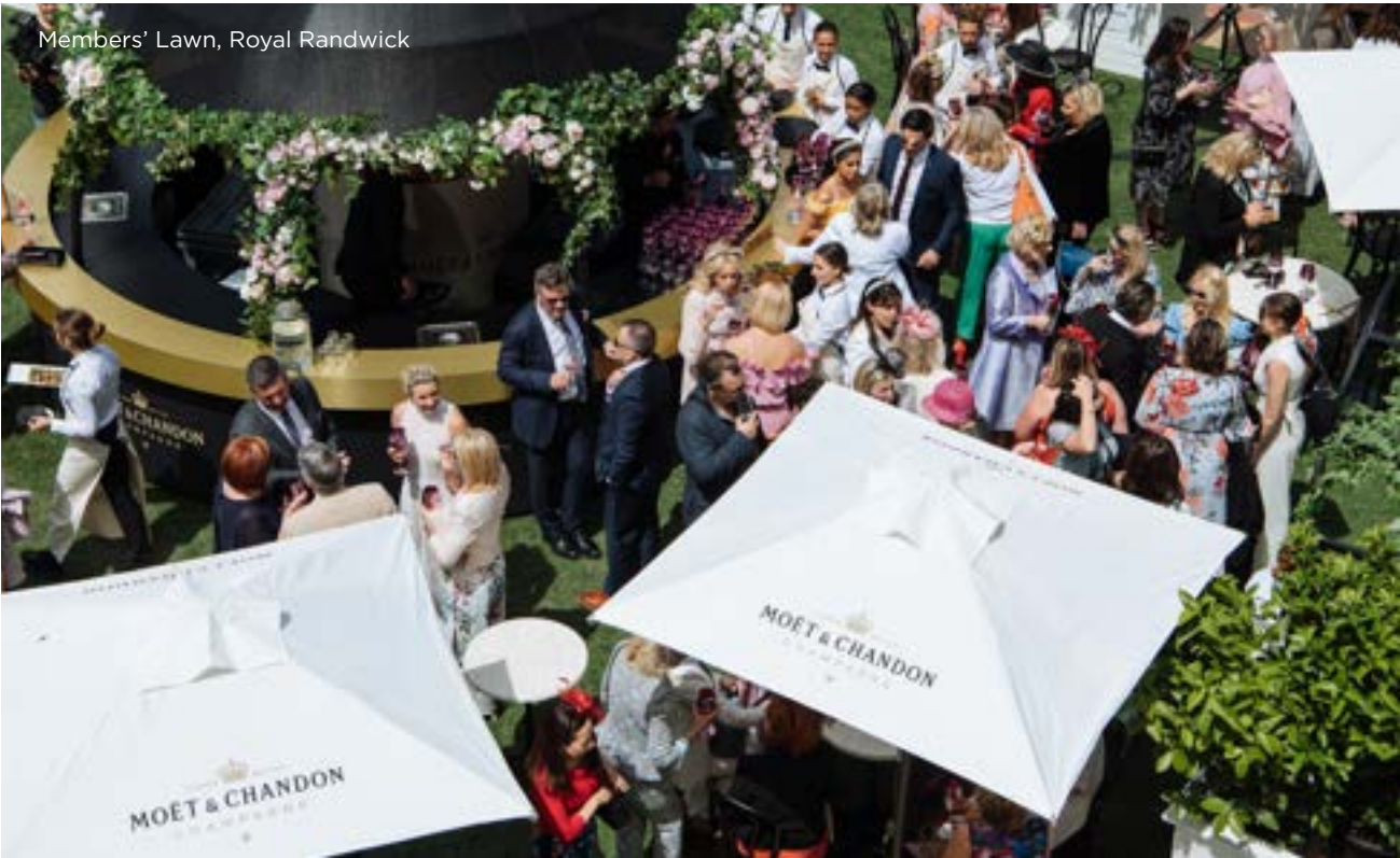
Members' Lawn, Royal Randwick