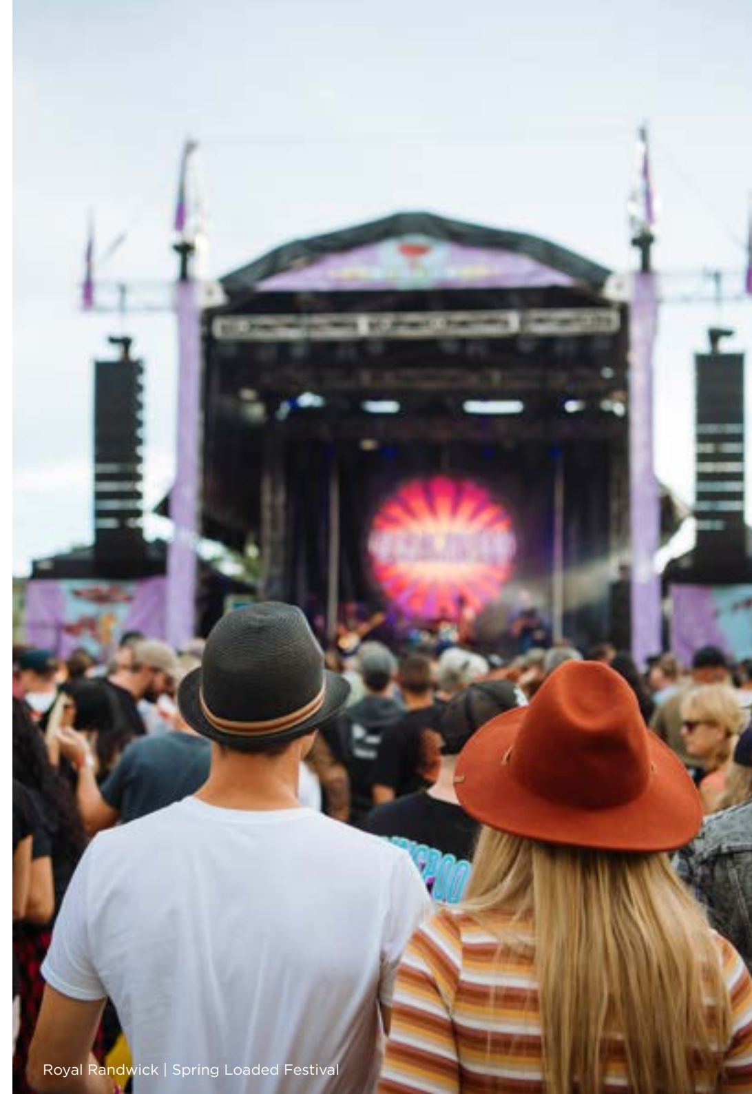
Royal Randwick | Spring Loaded Festival

Located in the Eastern Suburbs, the venue is only minutes from the CBD, hotels and famous beaches. Plentiful on-site parking, a dedicated light-rail service on our doorstep and proximity to the international airport makes the venue even more accessible.