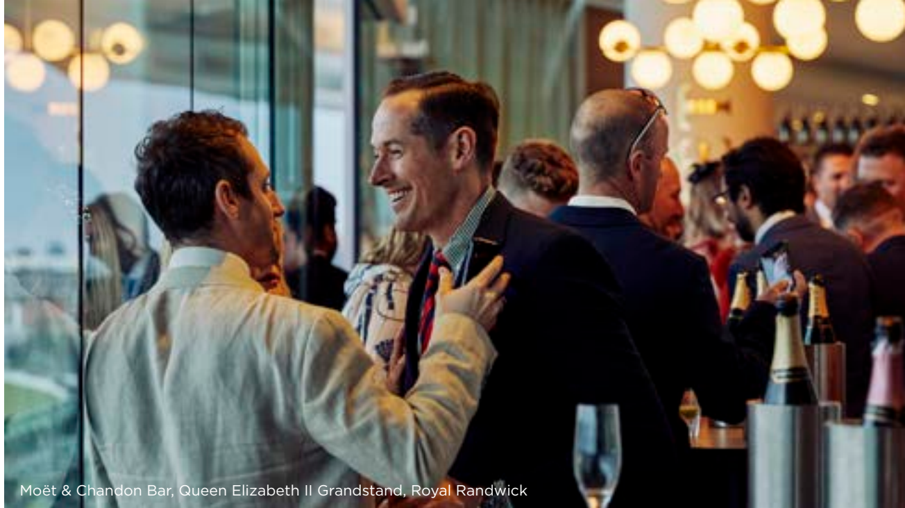
Moët & Chandon Bar, Queen Elizabeth II Grandstand, Royal Randwick

Enquire about our shared and private Christmas Party functions.