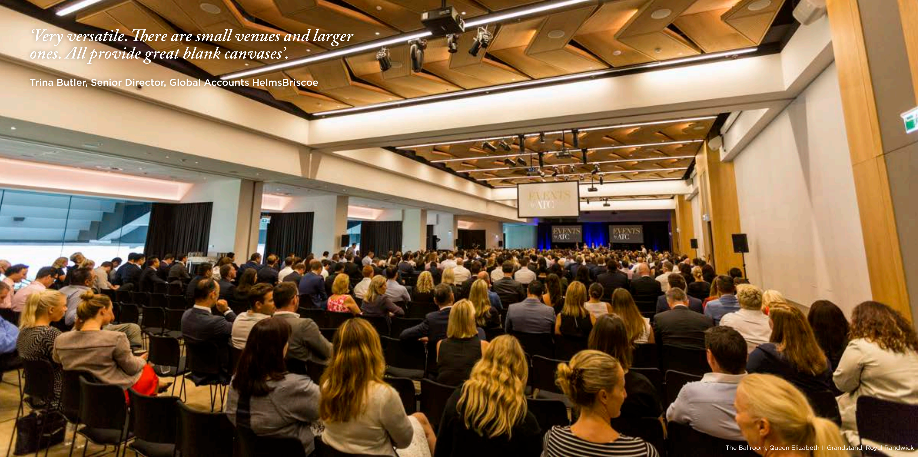
The Ballroom, Queen Elizabeth II Grandstand, Royal Randwick