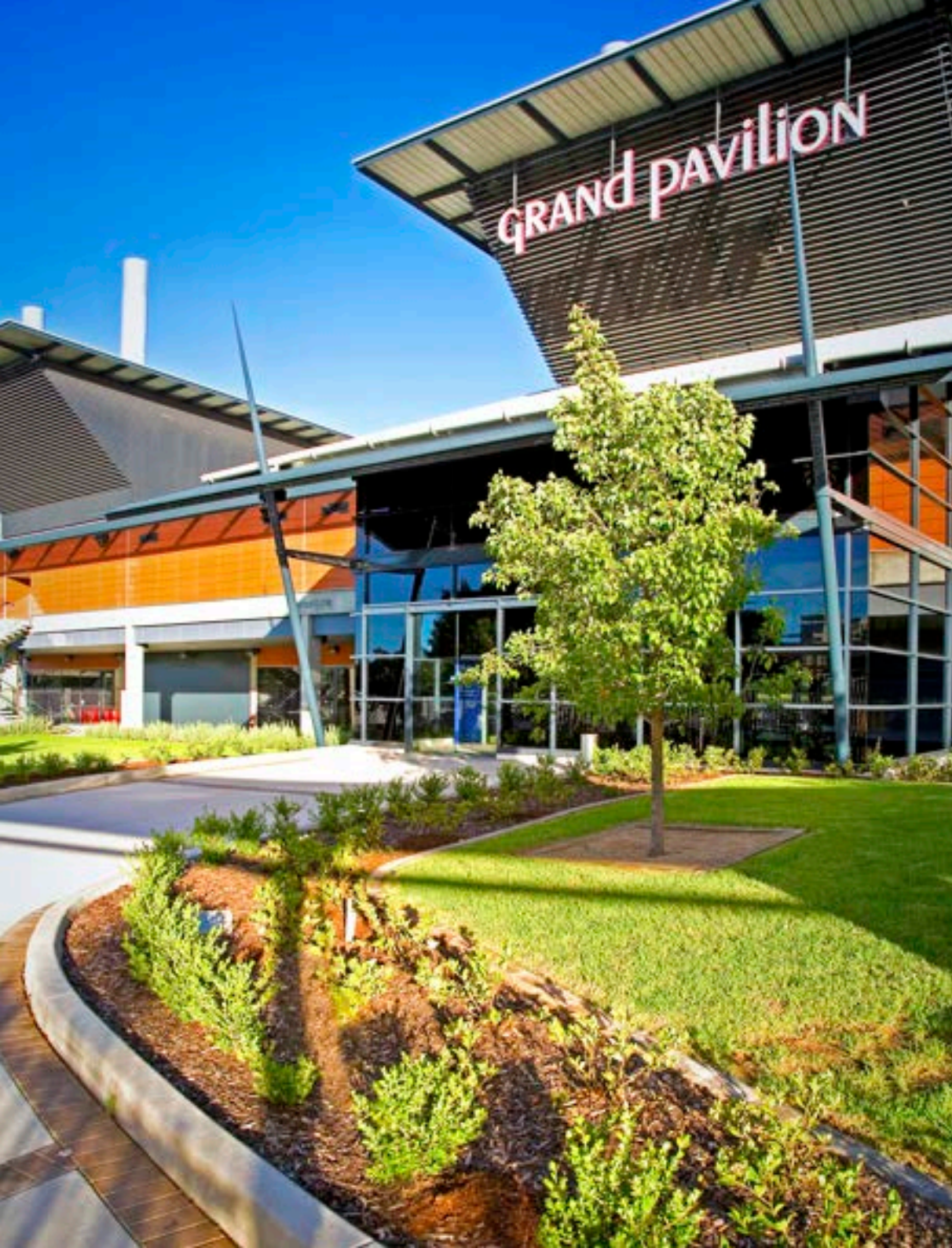
Grand Pavilion, Rosehill Gardens