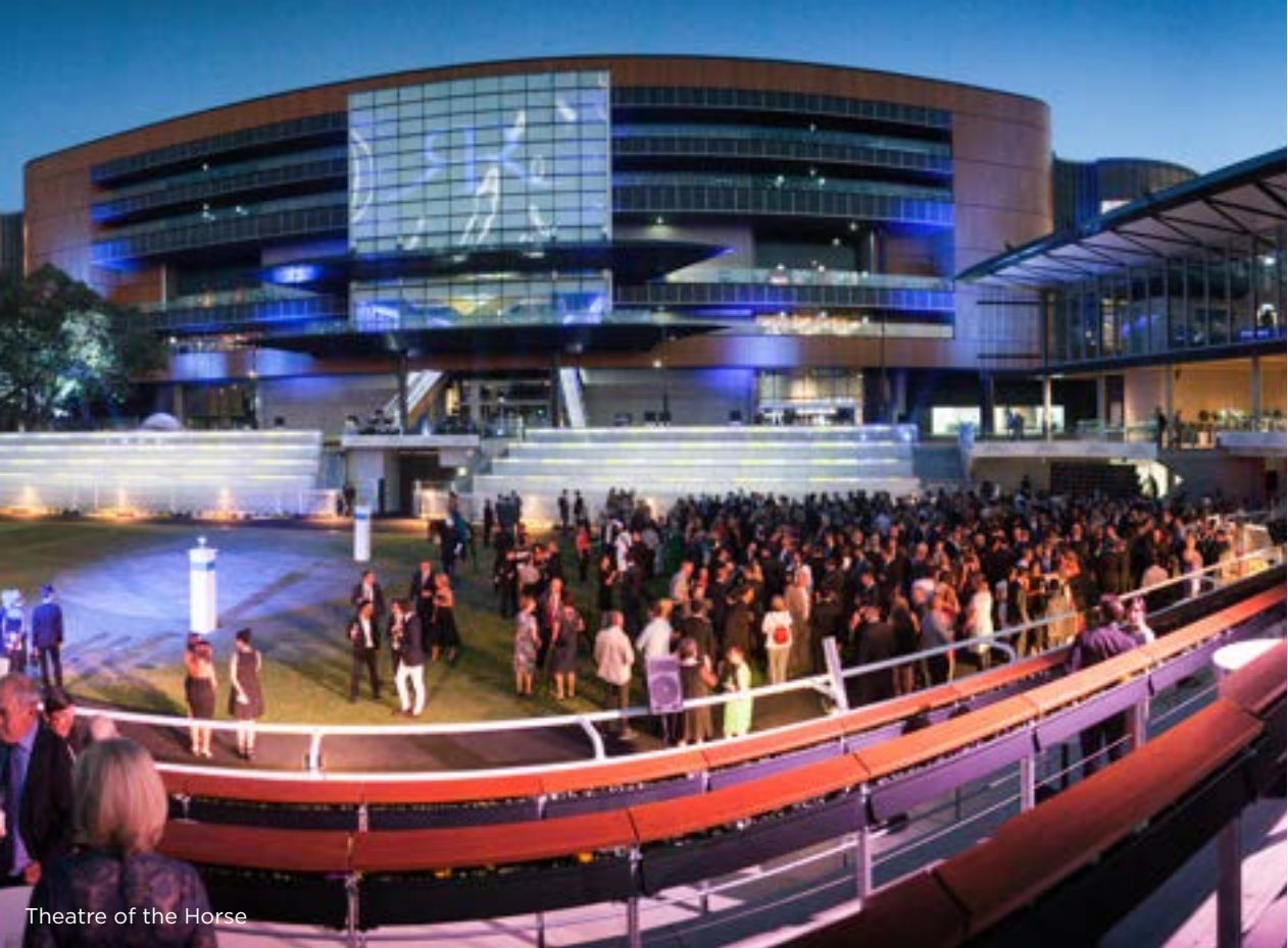
Theatre of the Horse