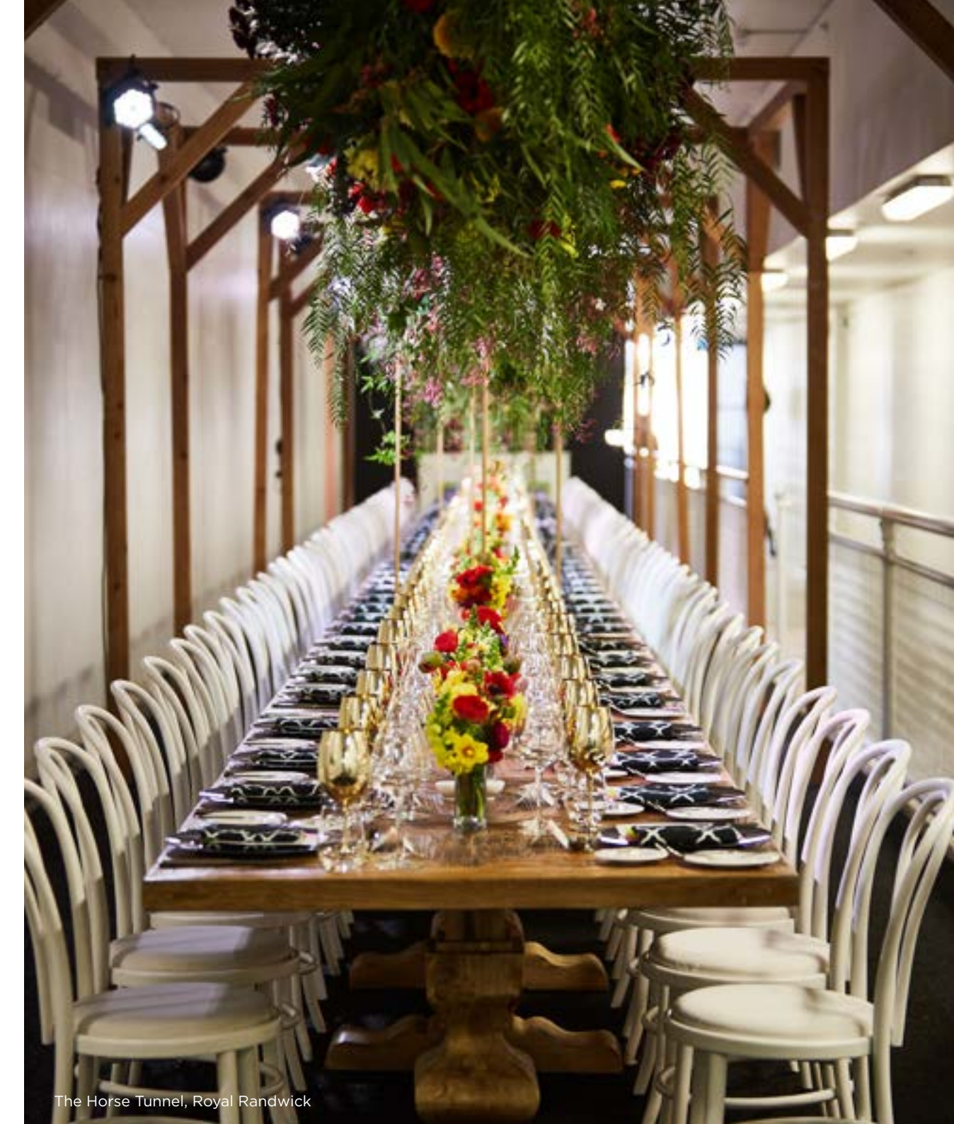
The Horse Tunnel, Royal Randwick

Our experienced events team will work with you to create events that are as inspiring as the setting, delivering tailored solutions to ensure every detail is as you imagined.