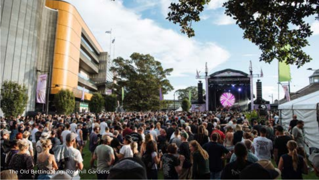
The Old Betting Ring, Rosehill Gardens

With many magnificent historic and contemporary buildings set in beautiful grounds, our venues are also a perfect location for filming. Over the years, we have played host to many television and film sets. Our flexible venues can transform into any location the script calls for.