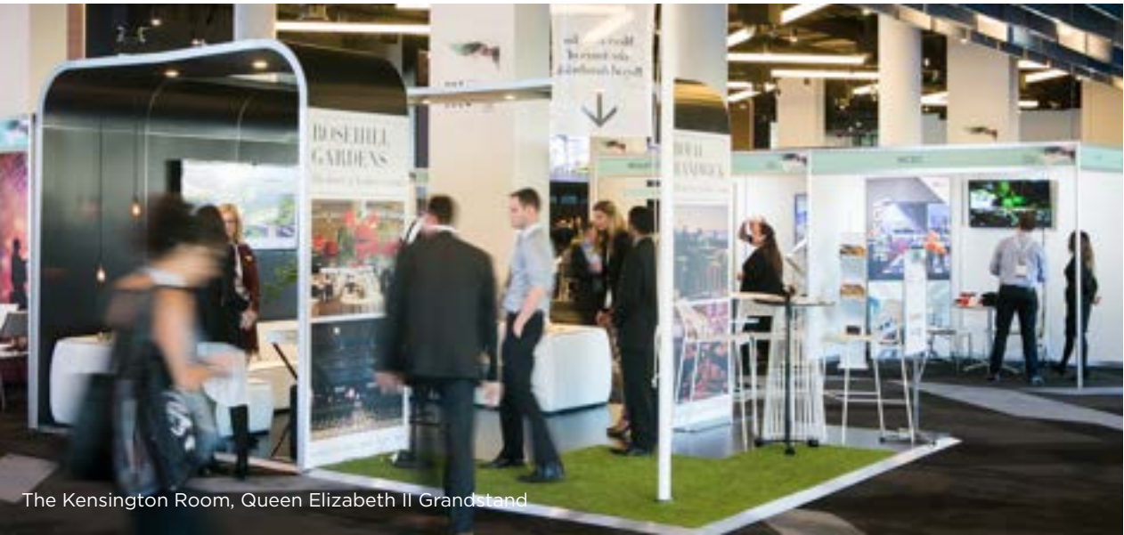
The Kensington Room, Queen Elizabeth II Grandstand