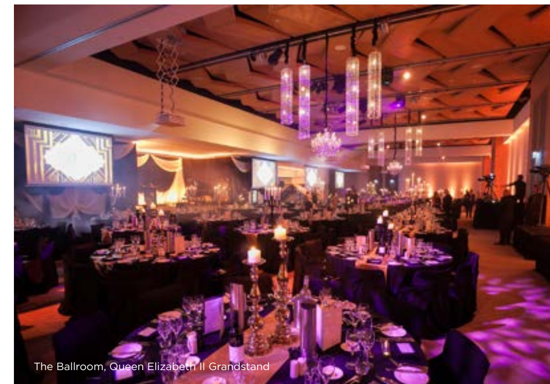
The Ballroom, Queen Elizabeth II Grandstand