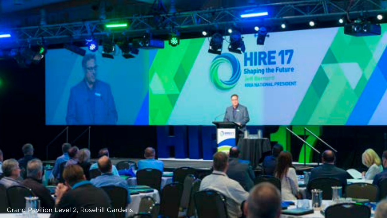
Grand Pavilion Level 2, Rosehill Gardens

Adjoining break-out rooms, discrete service, award-winning catering and top-class production means you can focus on your guests.