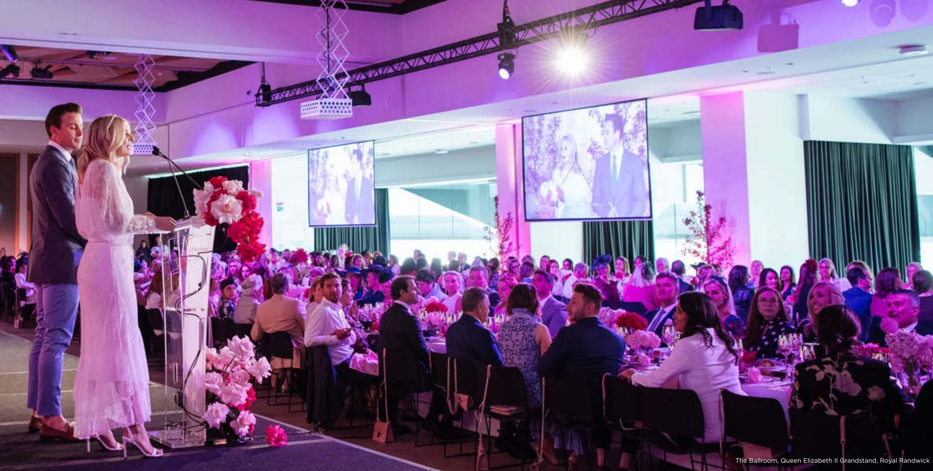
The Ballroom, Queen Elizabeth II Grandstand, Royal Randwick