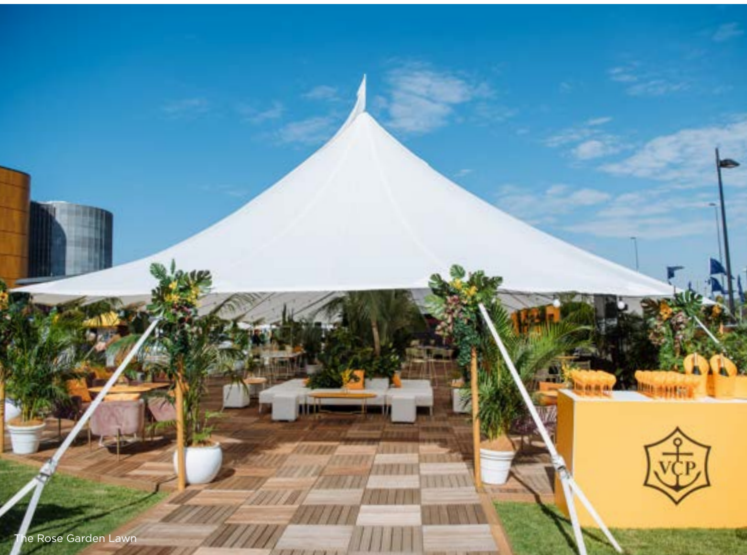
The Rose Garden Lawn