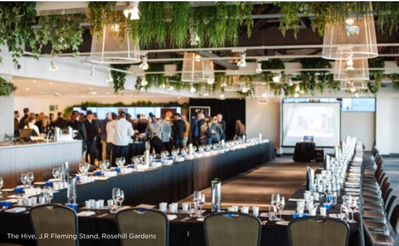
The Hive, J.R Fleming Stand, Rosehill Gardens