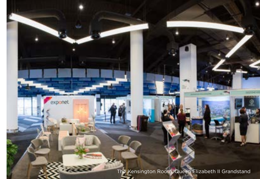
The Kensington Room, Queen Elizabeth II Grandstand