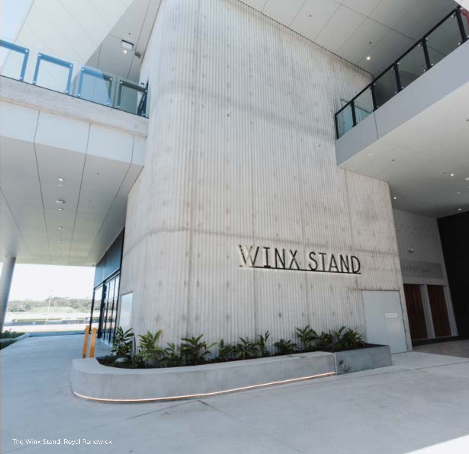
The Winx Stand, Royal Randwick