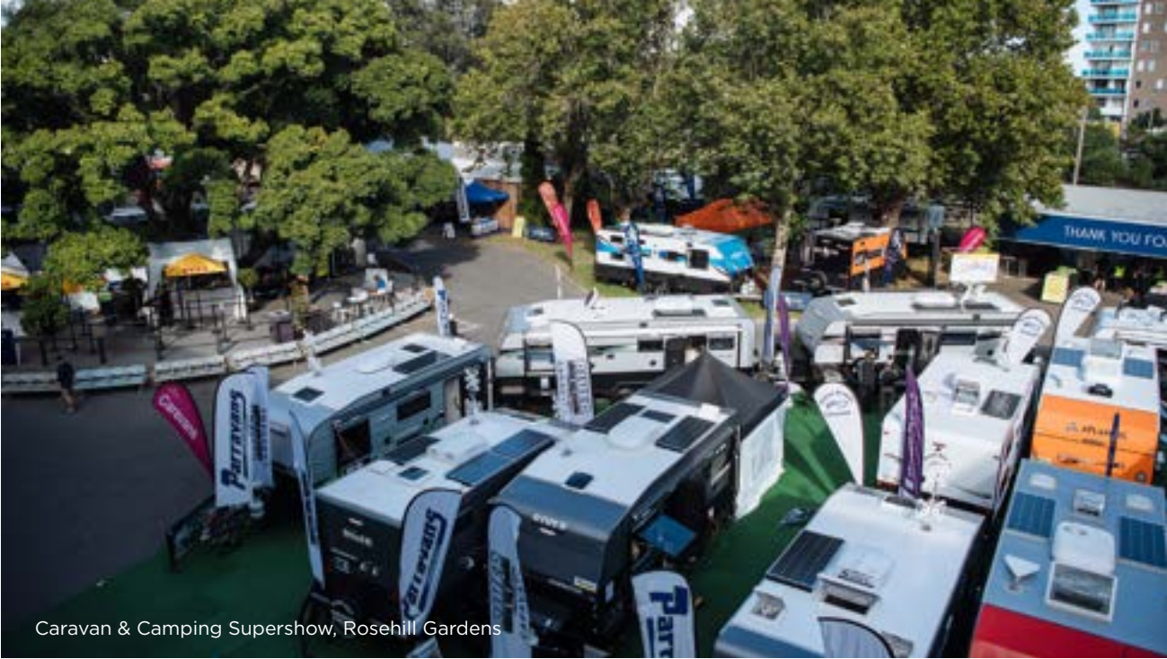
Caravan & Camping Supershow, Rosehill Gardens

Both Royal Randwick and Rosehill Gardens have the capacity to service major exhibitions, trade shows and product launches. Flexible indoor and covered outdoor spaces, ample parking, nearby accommodation and convenient access from around the city provide an unrivalled and holistic solution.