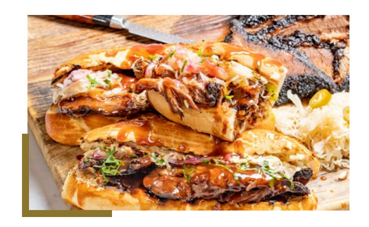
SYDNEY'S BEST PIES & FRESH MADE SANDWICHES PLUS MEMBER EXCLUSIVE EARLY BIRD SPECIALS ON COFFEE & CAKES