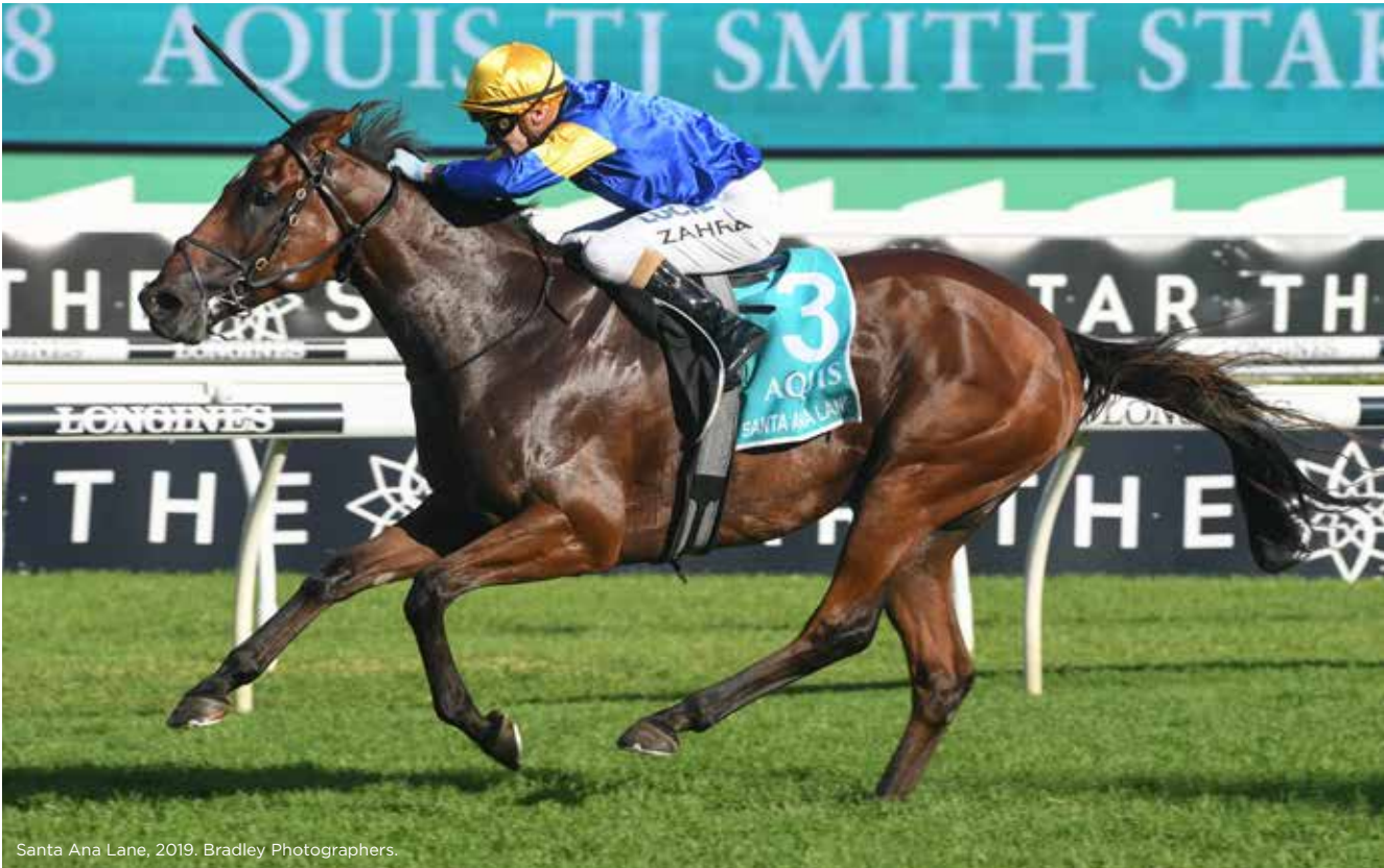
Santa Ana Lane, 2019.

The TJ Smith Stakes winner from the Autumn has already been slotted into the 2019 TAB Everest field and it was never going to take long for him to be snapped up. With five Group 1s to his name, he has a great international rating and his devastating last two furlongs has seen him come from off the pace many times to score. Adept on all ground, he will be tough for rivals to hold off in the $14m showpiece.