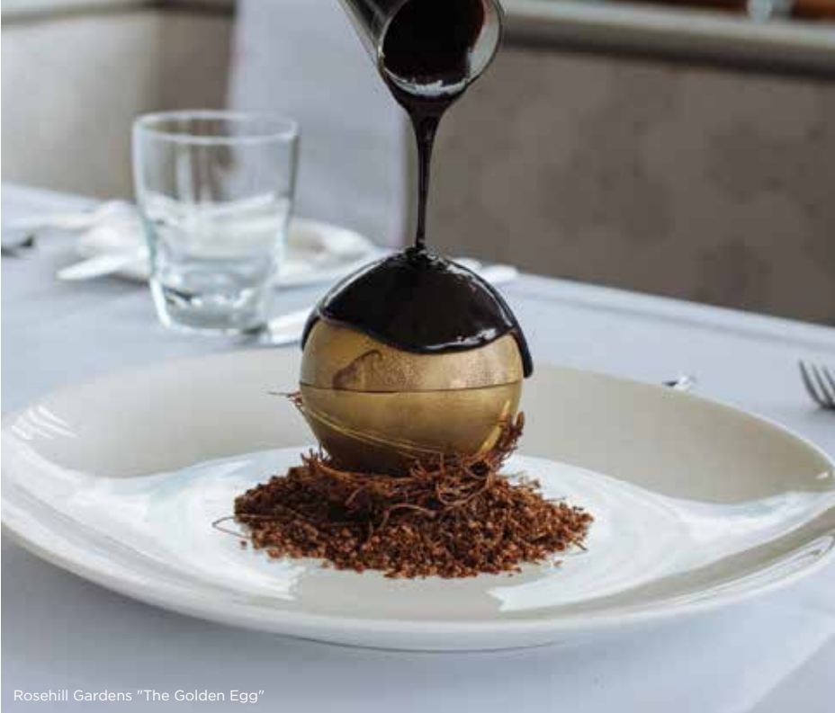
Rosehill Gardens "The Golden Egg"

Sydney rock oysters from Wonboyne, Grainge Black Angus beef, King prawns from Yamba and humpty doo barramundi are just a taste of what fine diners can expect.