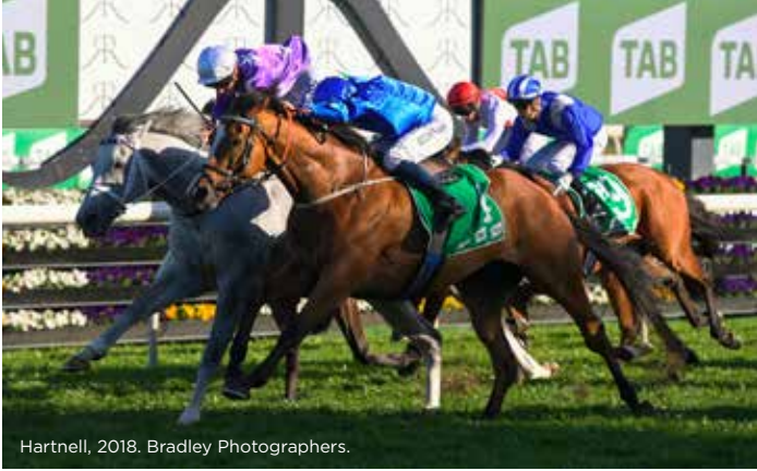
Hartnell, 2018. Bradley Photographers.