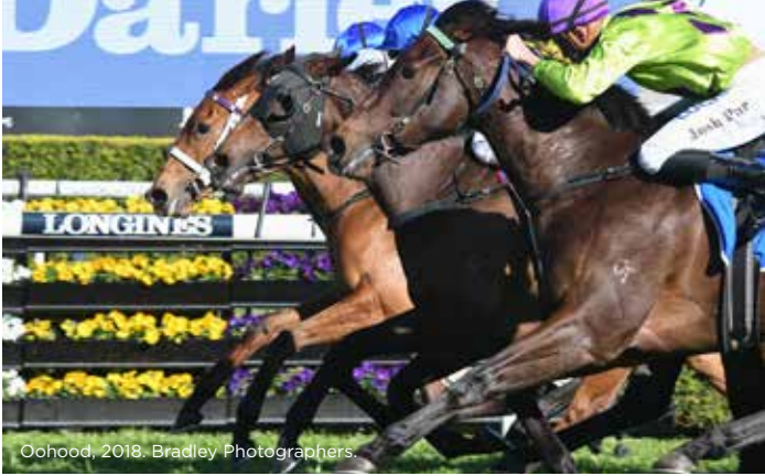
Oohood, 2018.