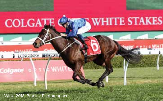
Winx, 2018.

The TAB Epsom run a fortnight later these days often has its form best shown from the George Main run at weight-for-age.