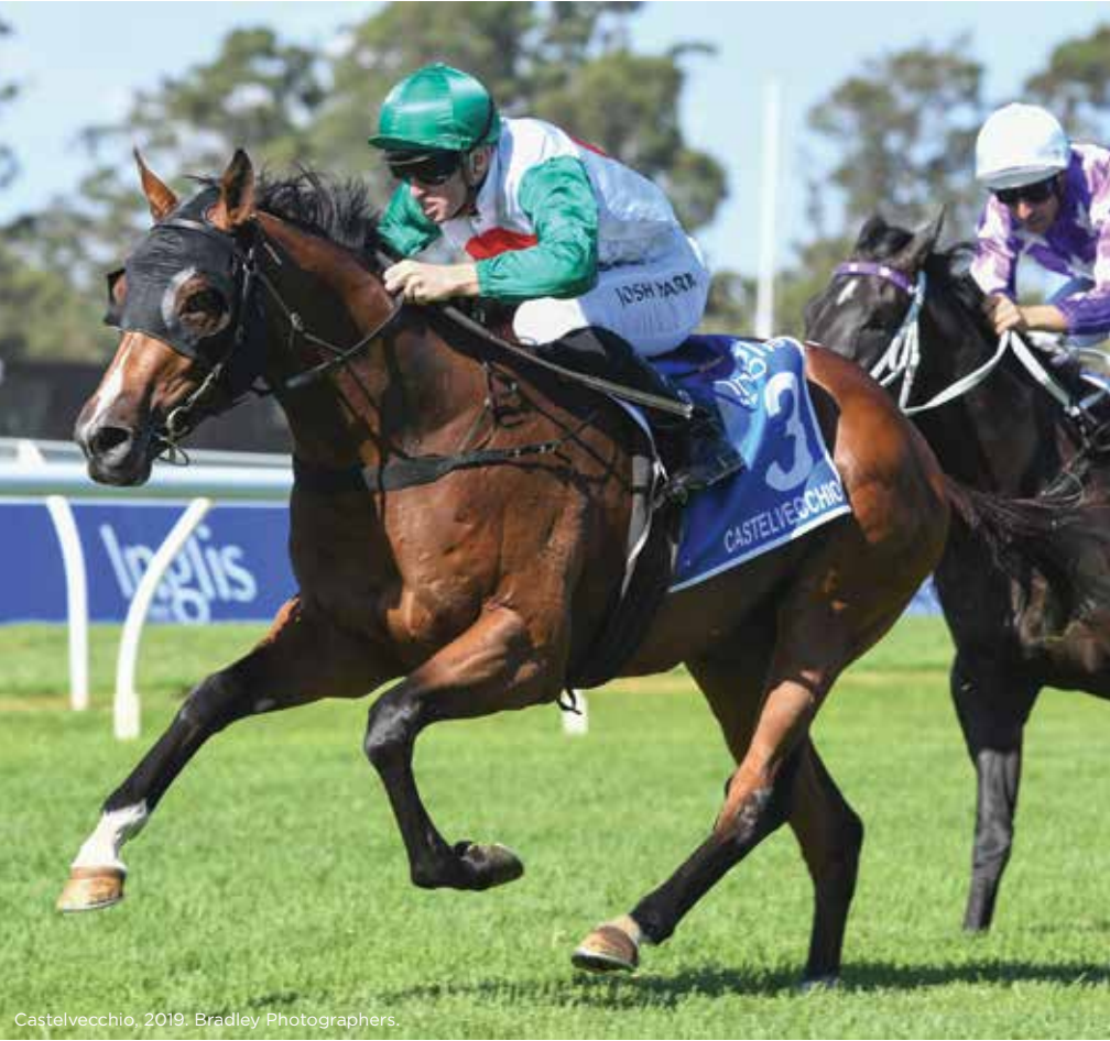
Castelvecchio, 2019.

While yet to run beyond 1200m, Flit has shown she could easily be capable of getting a mile and become a live Group 1 Flight Stakes chance. She missed by a nose in the Percy Sykes and Godolphin generally set their elite fillies for the feature mile at Randwick. Watch for her over the Darley Princess Series.