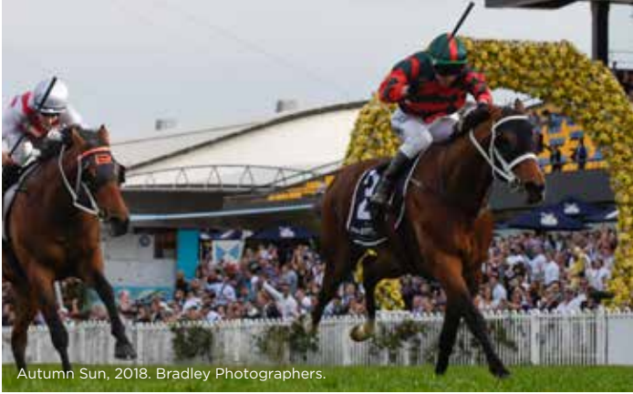
Autumn Sun, 2018.

GROUP 1 (1400M) 3YO SET WEIGHTS $1,000,000