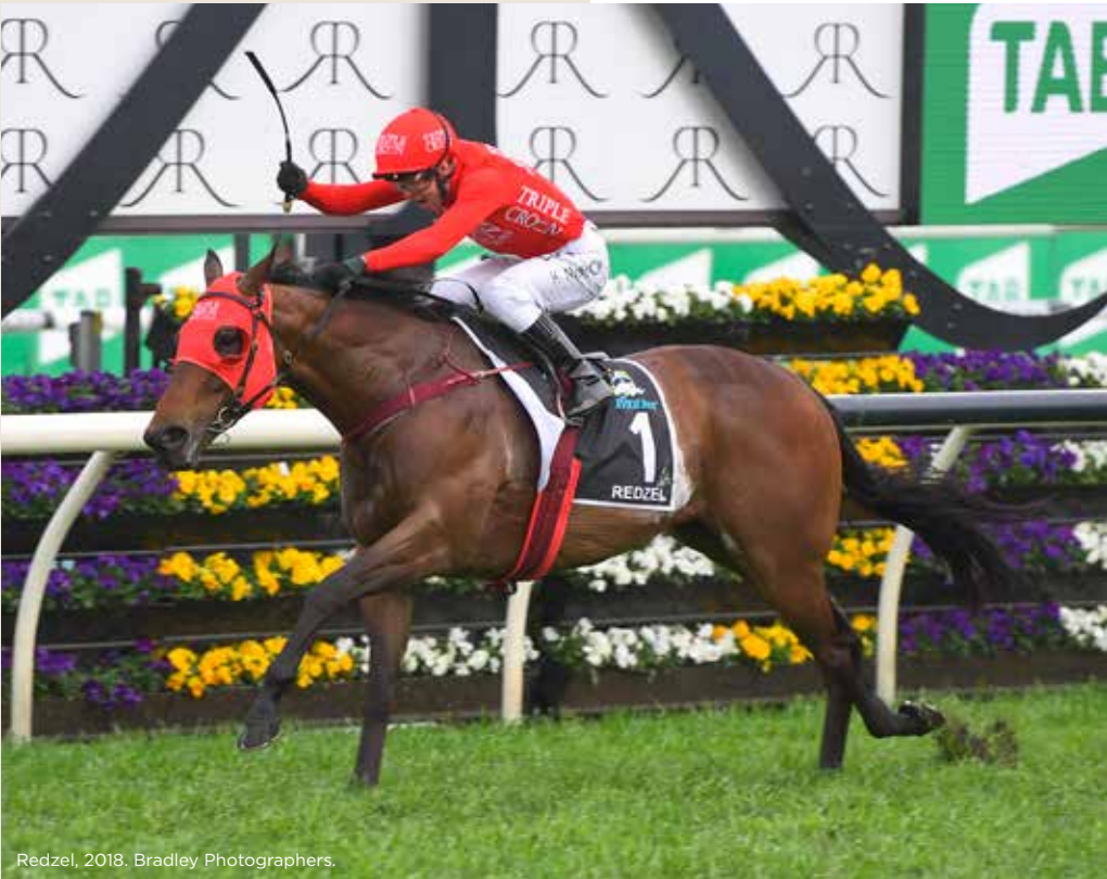
Redzel, 2018.