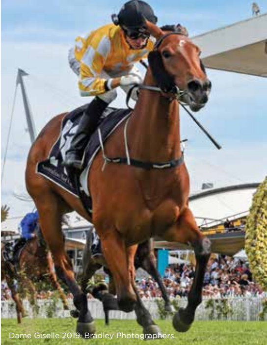
Dame Giselle 2019.

You had to be looking forward when seeing what this import did at the end of his first racing season in Australia. Now that he has had time to acclimatise and enjoy that spell, expect him to be measuring up in the staying contests. He will need ground in time as we saw first up when outsprinted but staying on.