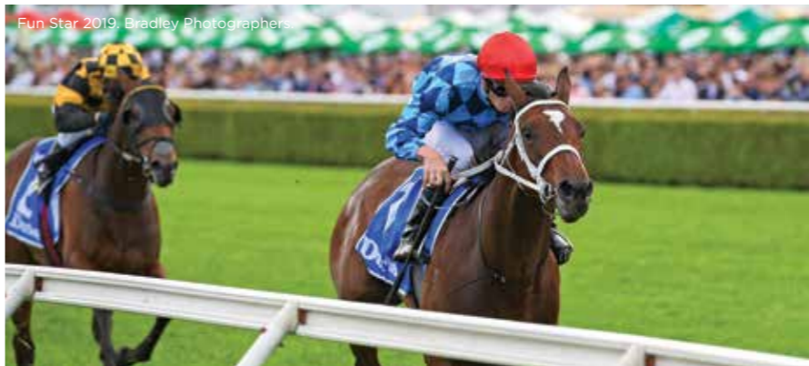
Fun Star 2019.

Still effectively in her first preparation, the Kiwis have another top drawer stayer in the making. She had form around the better ones of her generation in NZ before the New Year and then got to the Waikato Guineas where she destroyed a last start G1 winner by over 7L. Will be a big contender for the Oaks if she crosses the Tasman.